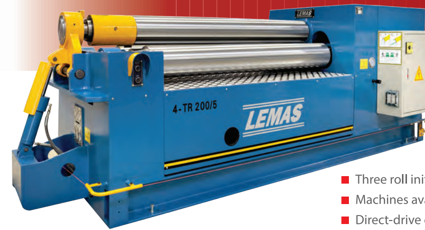
Plate Bending Rolls