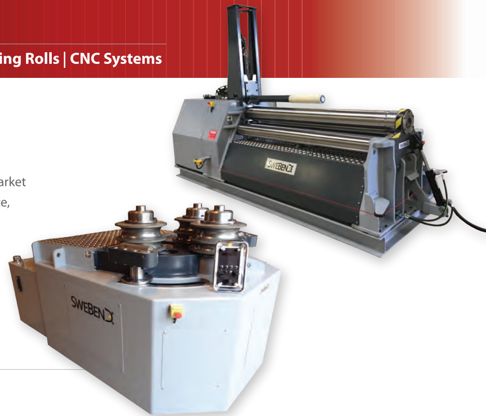
Plate Bending Rolls