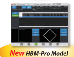
New HBM-Pro Model