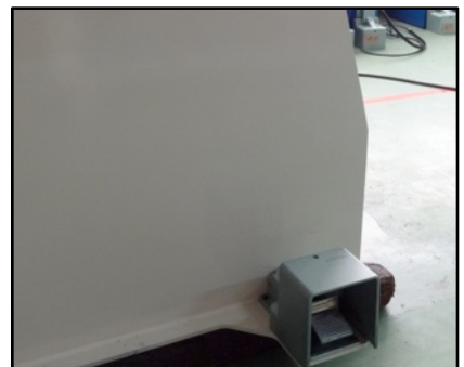
Bending Station Foot Control

FACTORY SUPPORT, SERVICE and OEM PARTS - Office/Warehouse/Showroom - Belcamp, Maryland