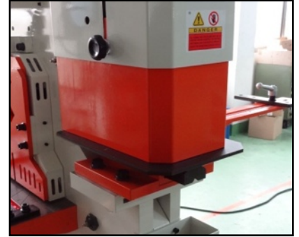
Integrated Safety Features