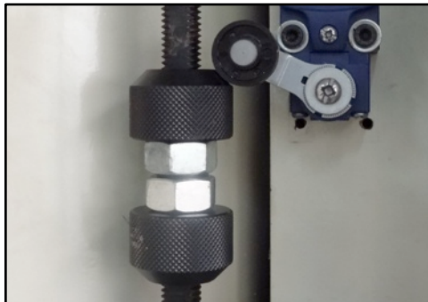
Threaded Actuator for Fine Stroke Adjustment