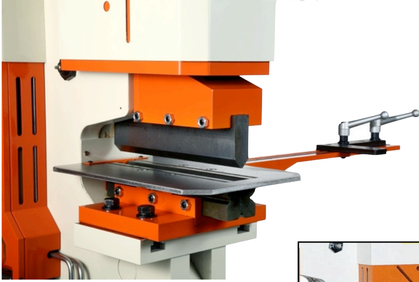
Model IW-66KB Integrated 12" Press Brake