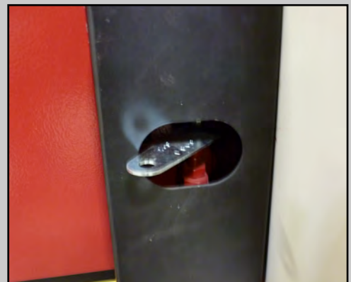
Pinch Gap Control