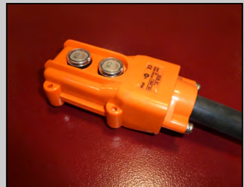
Hand-Held Rotation Control