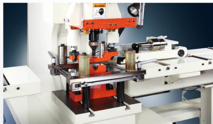
Specially designed strippers and punching accessories for processing a wide variety of materials.