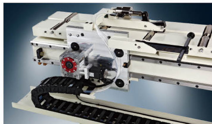
The highly precise gear drive components provide high accuracy, high repeatability, and high efficiency.